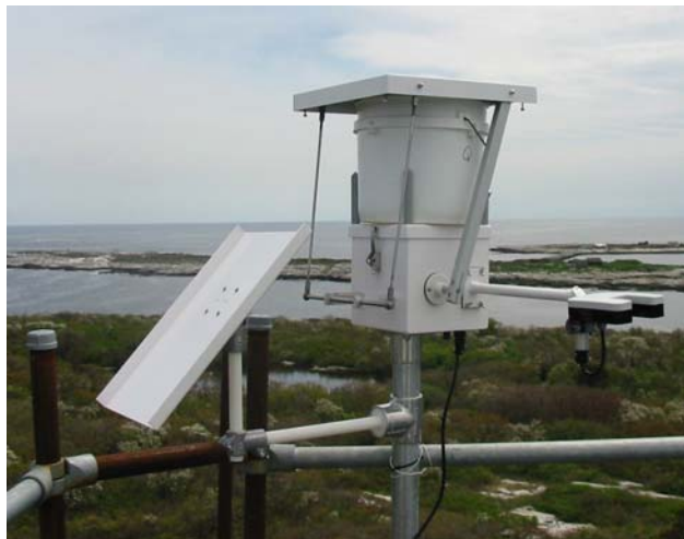
Closed cover sealing sample collection container