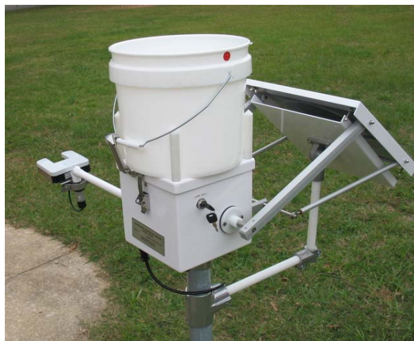
Open cover resting on splash shield